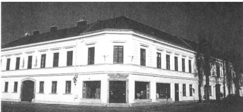
New IFIP headquarters in Laxenburg, Austria (at right, first floor)