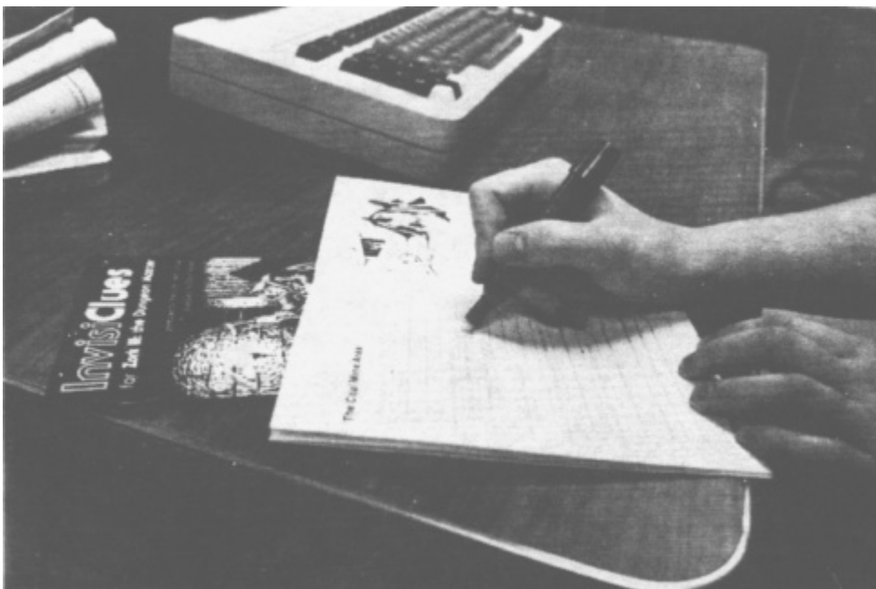
InvisiClues . PC magazine called them, "almost as much fun as Zork ." They are fun, and quite useful, too. Even experts who have finished the game will find out about things they missed.

We now have the solution: heat transfers! The Zork logo (brown, yellow, and black) has been printed with special heat-transfer ink. We will ship you the transfer sheet which you can take to a T-shirt shop which does heat transfers. There you can pick out the T-shirt of your choice. (Note: using a standard household iron is not recommended; however, a photographer's mounting press can be used.)